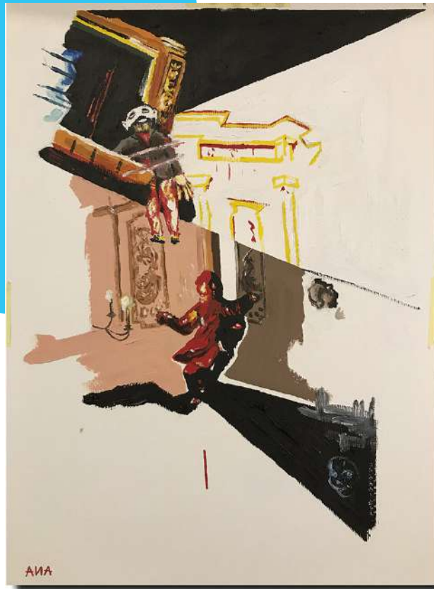
'Untitled 2' oil painting on paper (50x70cm)

The completion of this work coincided with the exhumation of the dictator who ruled Spain years ago. I found the comparison curious and I decided to recreate it.