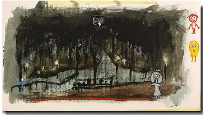
'Cemetery at night' oil painting on paper' (17x33cm)

Even if the cemetery was scary, it could perfectly be a playground for children, even at night.