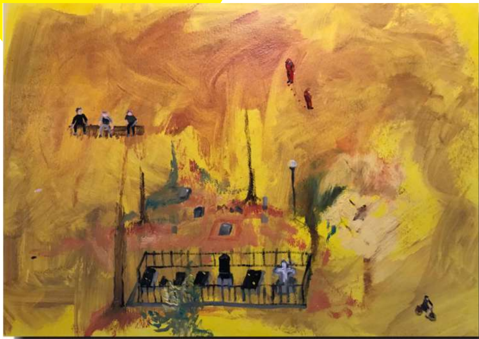
'The cemetery that I see through my window, some kids with Polish music and a gardener' oil painting on paper (35x50cm)

This work combines several Polish elements (a Poznan cemetery, Polish children playing and typical cartoons from there) with characteristic elements of Spain such as the sun.