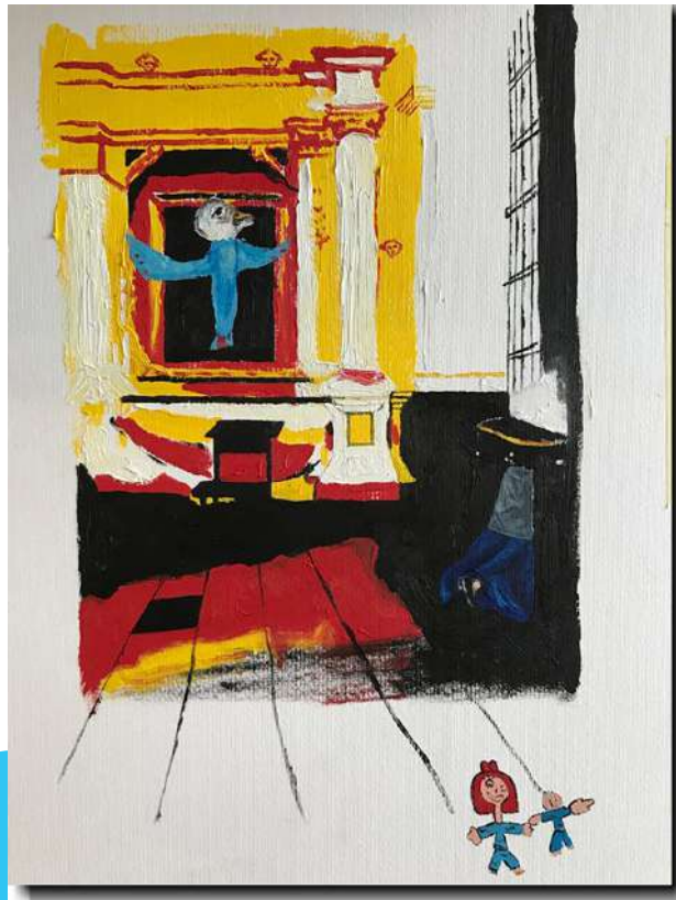
'Untitled 1' oil painting on paper (70x50cm)

The completion of this work coincided with the exhumation of the dictator who ruled Spain years ago. I found the comparison curious and I decided to recreate it.