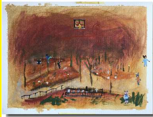
'Cemetery during the day' oil painting on paper (24x33cm)

When I arrived at my room it always received me, so I decided to paint it.