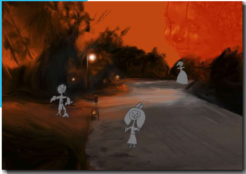
'Children playing in the cemetery' oil painting on paper (21x29,7cm)

Even if the cemetery was scary, it could perfectly be a playground for children, even at night.