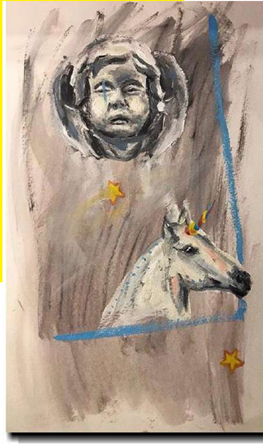
'Angels are like unicorns' oil painting on paper (70x50cm)

When I arrived to Poland I could see that church is a strong institution there. On the one hand it was surprising to me because in Spain is not that strong and even less in my family or friends. While I was going to university I saw several times how little kids with their familys went to mass or just how they enter to the church for pray. That's why I decided to talk about it with painting.