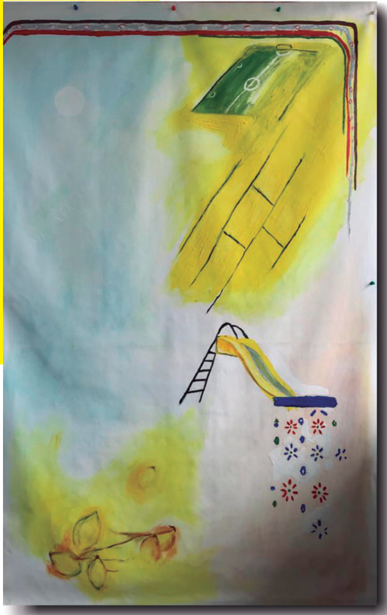
'The way home' oil painting on canvas (180x80cm)

Actually this work is still in progress because I would like to continue working on it and maybe add other elements. Anyway, I did to represent the way to my home that I used to do with my mother before and after school. It could be named as 'map' as well.