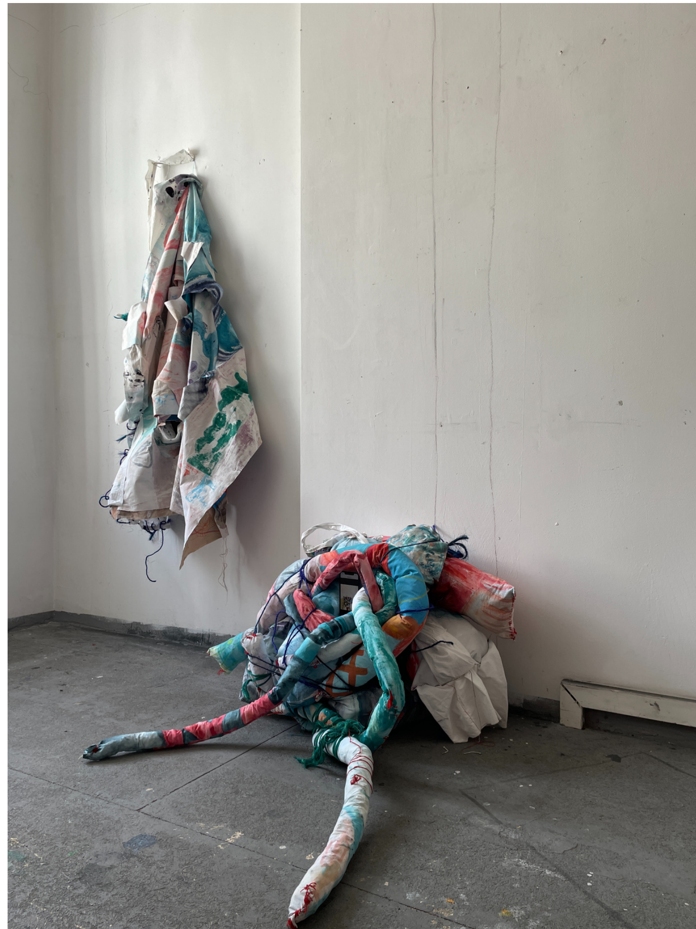
Angèle Guy , MOI Inside, fabric sculptures , 70x80x70 and 200x100 2022, Poznan