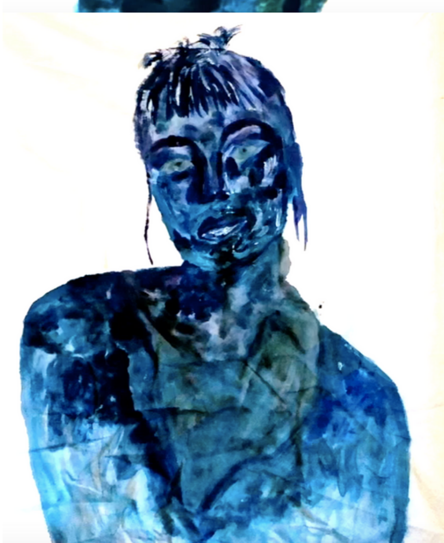
Angèle GUY MOI Inside, Acrylic Paint on Fabric, 200x100 2022, Poznan